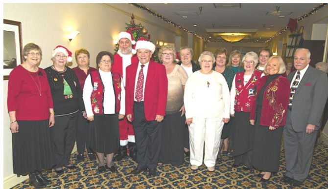
Santa with the Grand Family