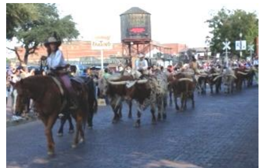
Longhorns on their way to the rodeo