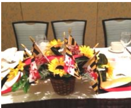
A beautiful centerpiece at the Maryland Breakfast